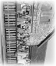
Honiton, Devon, England